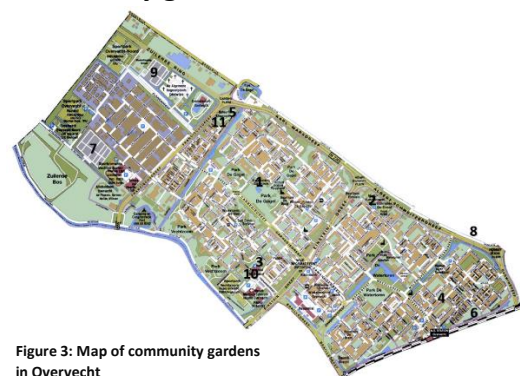
Figure 3: Map of community gardens in Overvecht